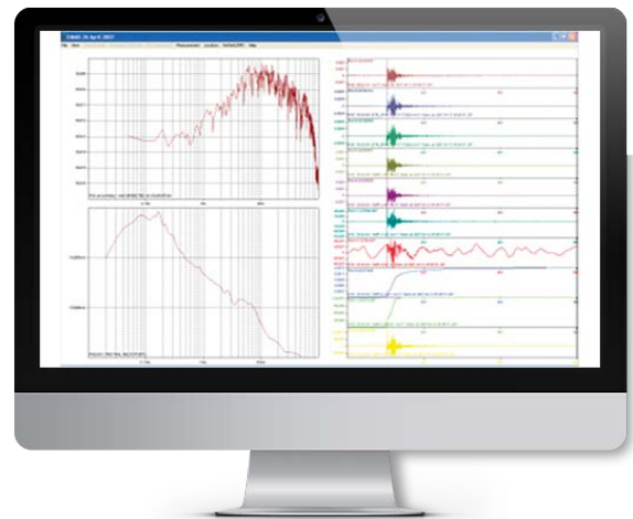
Figure 4. Strong Motion Data Processing Software