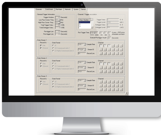
Figure 3. Parameter Settings